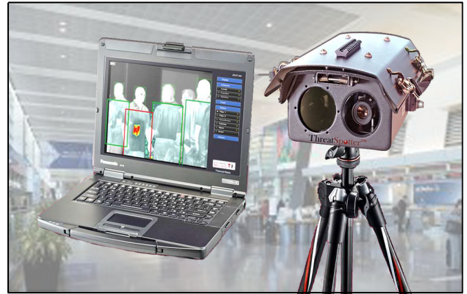
Portable Rapid Deployment or Fixed Versions